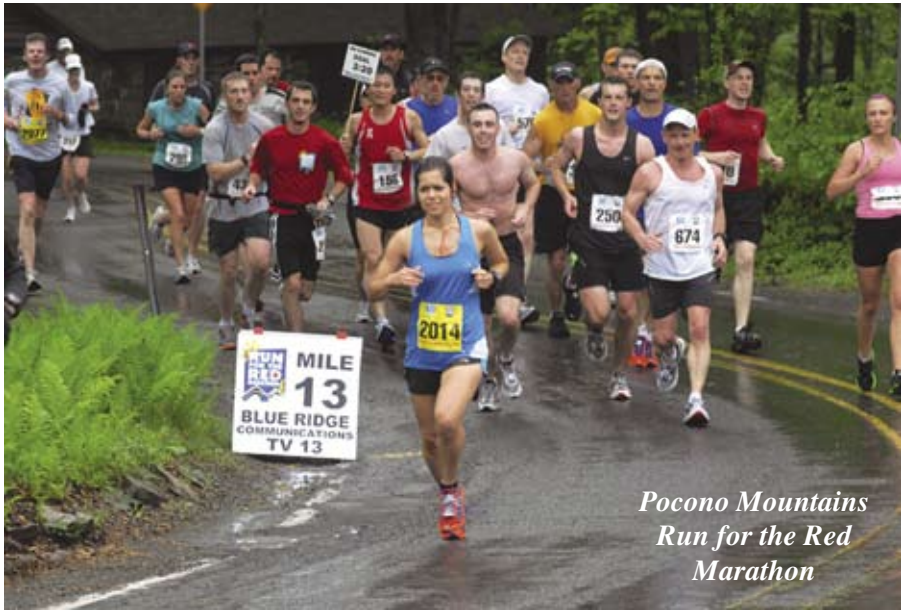
Pocono Mountains Run for the Red Marathon